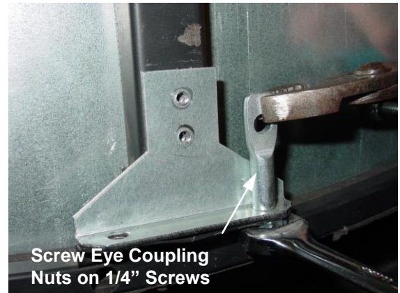
Figure 2 Install Eye Coupling Nuts