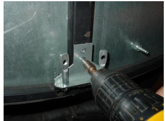
Figure 3 Drill Tek Screws