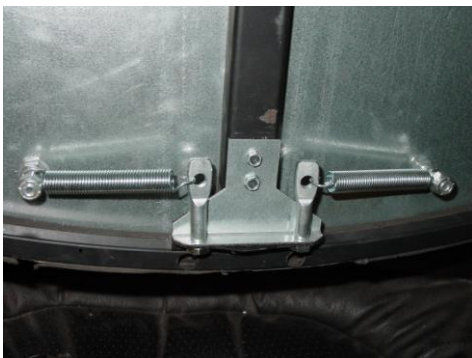
Figure 5 Completed Assembly