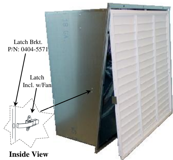
Figure 4 36" & 48" Mega-Flow Slant-Wall Fan